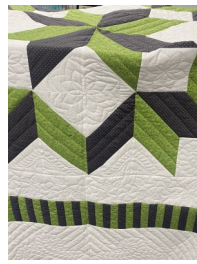
Sharon Reckelhoff Group